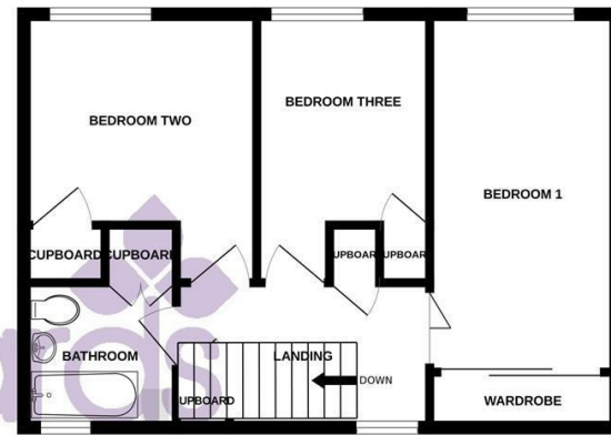
1ST FLOOR 458 sq.ft. (42.6 sq.m.) approx.