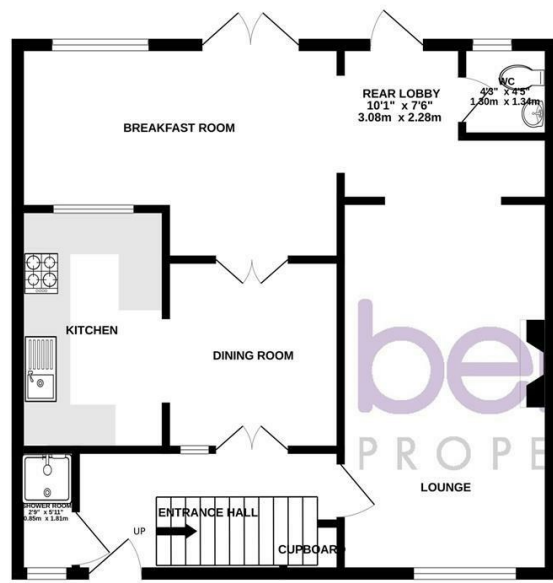
GROUND FLOOR 645 sq.ft. (59.9 sq.m.) approx.